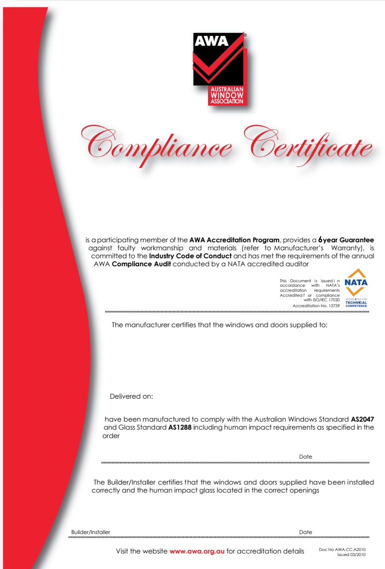
Example of Compliance Certificate used by AWA Members

Certificates, indicating window performance can be provided for window assemblies in residential applications. The manufacturer of the window assembly would normally provide this certificate.