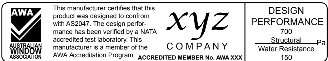
Example of labelling used by AWA Members